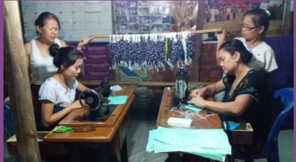
Photos: (Below) KWO staff in Umpiem making masks for the most vulnerable groups including women & children