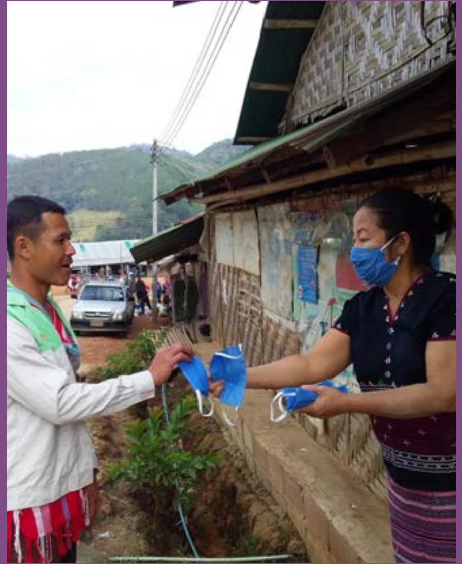
Photos: KWO staff distributing masks made by KWO in Umpiem Refugee Camp