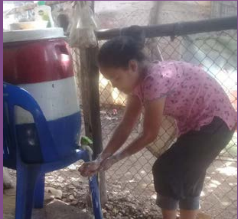
(Bottom, right): A handwashing station in use in Mae La Refugee Camp.