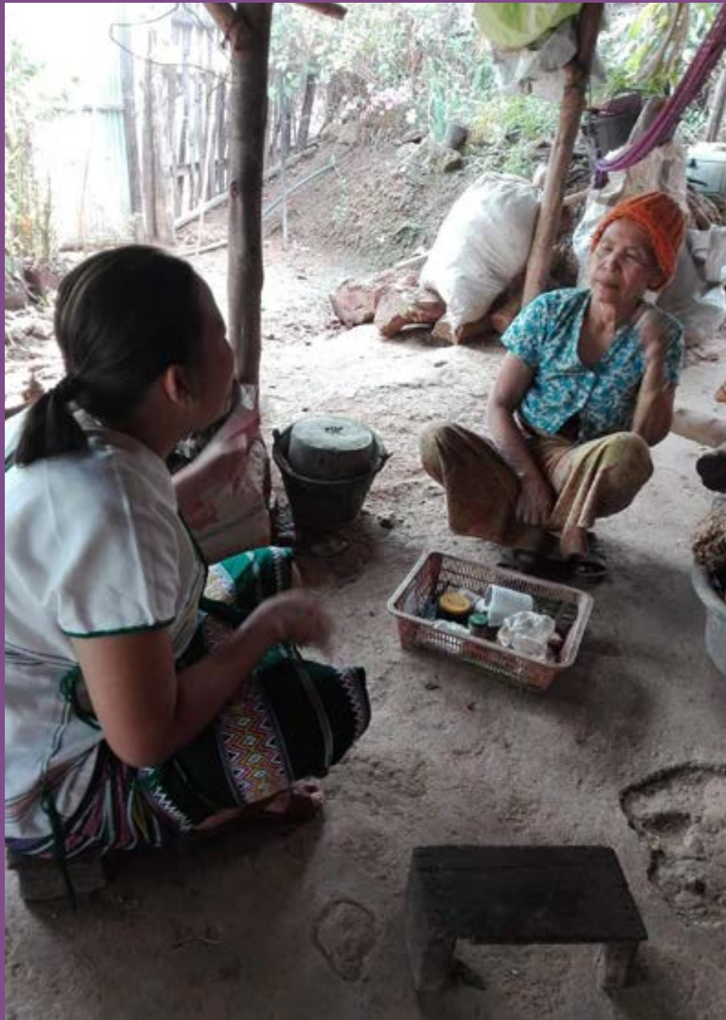
Photos: (Left) KWO staff doing home visits in Umphiem Refugee Camp.