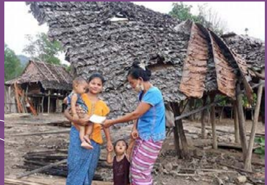
Photos: KWO staff doing home visits in Hpa-An, Karen State