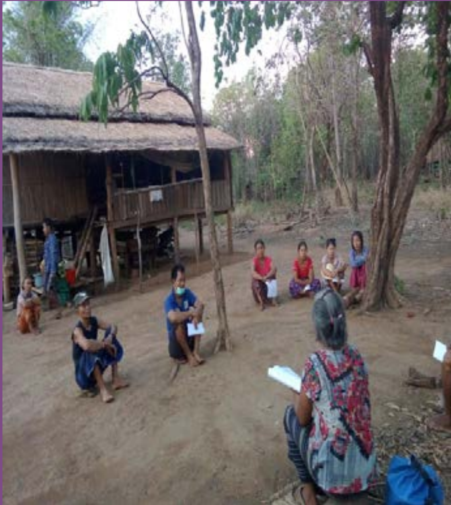
Photos: (Above) Residents in Kler Lwee Htu, Karen State, listening to KWO awareness raising on COVID-19